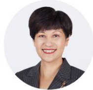
Ms. Indraneel Rajah Minister in the Prime Minister's Office, Second Minister for Finance & National Development Guest-of-Honour