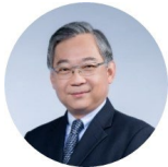
Gan Kim Yong Deputy Prime Minister and Minister for Trade and Industry Republic of Singapore