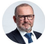
H.E. Csaba Lantos Minister of Energy Hungary