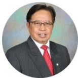
YAB Datuk Patinggi Tan Sri (Dr) Abang Haji Abdul Rahman Zohari bin Tun Datuk Abang Haji Openg Premier of Sarawak Malaysia