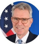
H.E. Geoffrey R. Pyatt Assistant Secretary Bureau of Energy Resources Department of State, United States