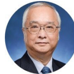
H.E. Tse Chin-Wan Secretary for Environment and Ecology Hong Kong SAR, China